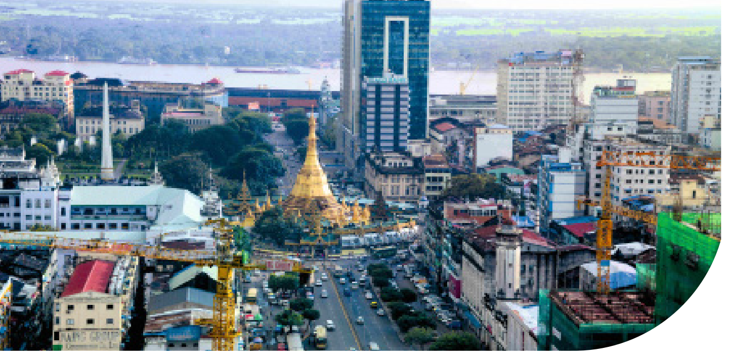
Yangon city center, Myanmar.